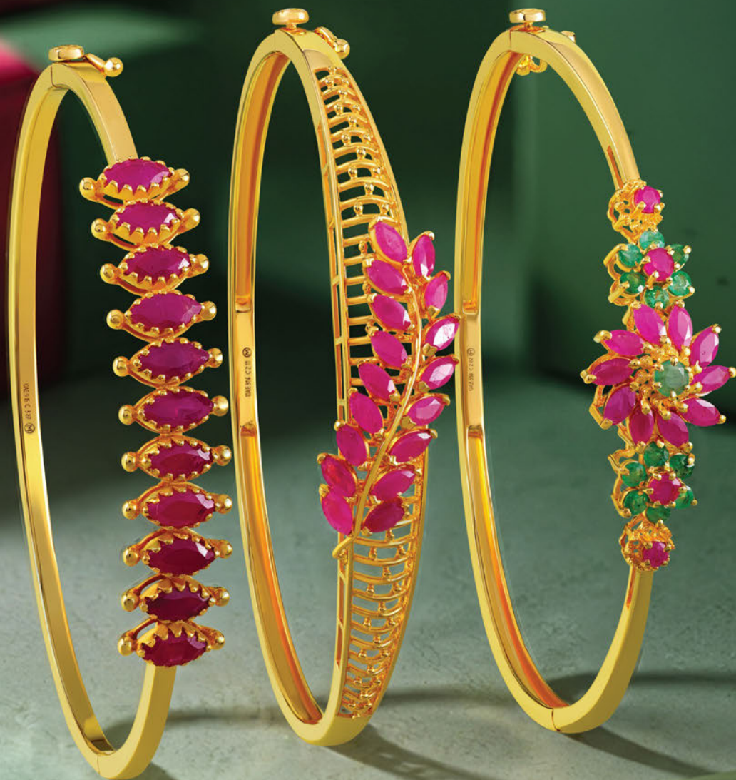
PGNTRA181BN1 PJRGGEN096OB1 PGNFNC004BN1