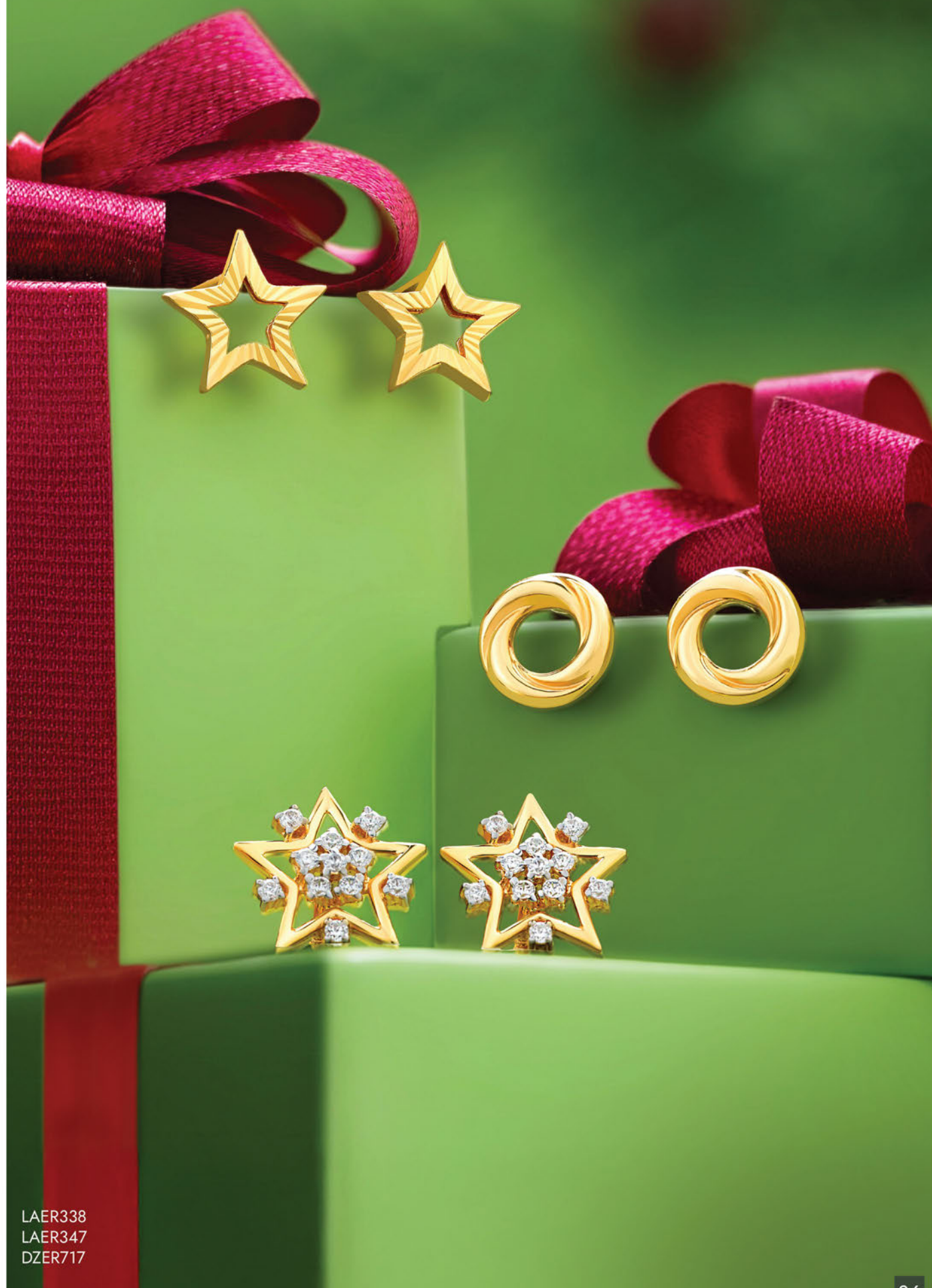
LAER338 LAER347 DZER717