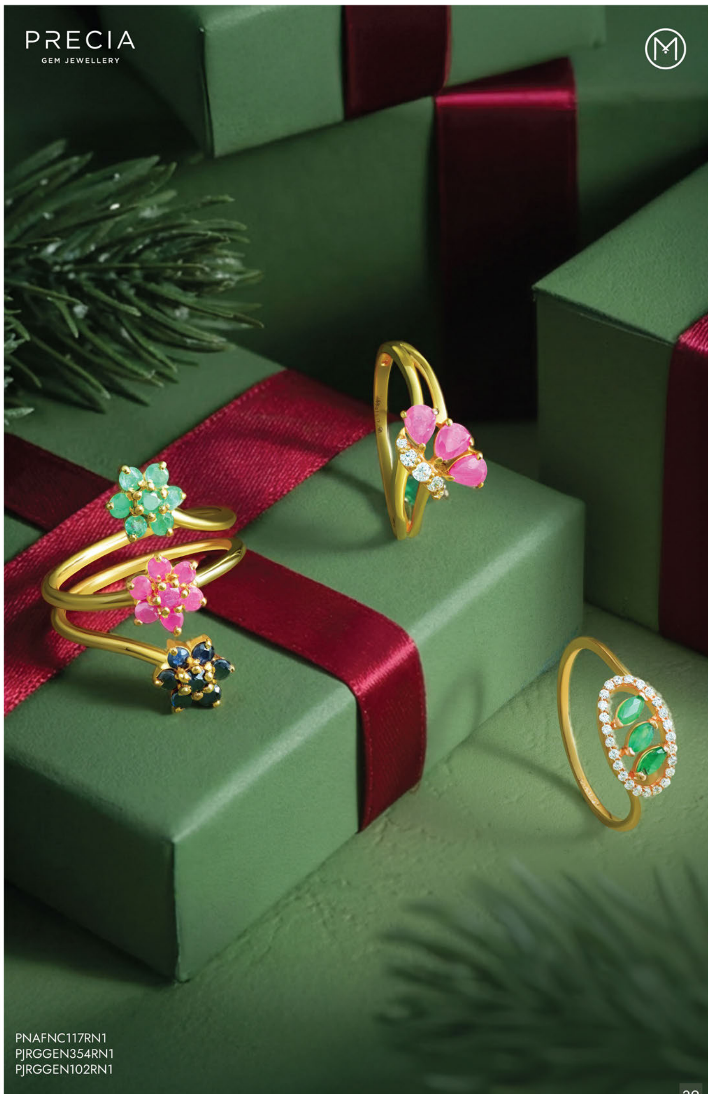
PNAFNC117RN1 PJRGGEN354RN1 PJRGGEN102RN1