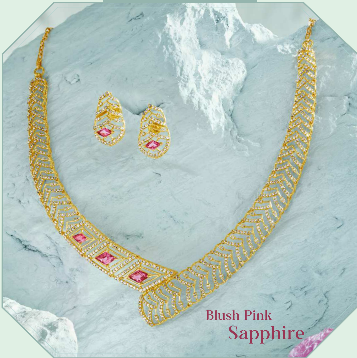
Blush Pink Sapphire