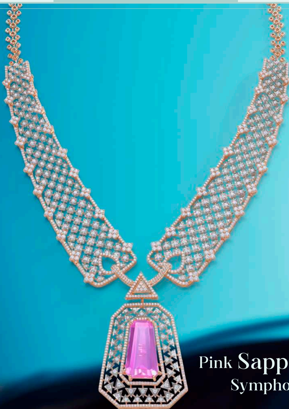
Pink Sapphire Symphony