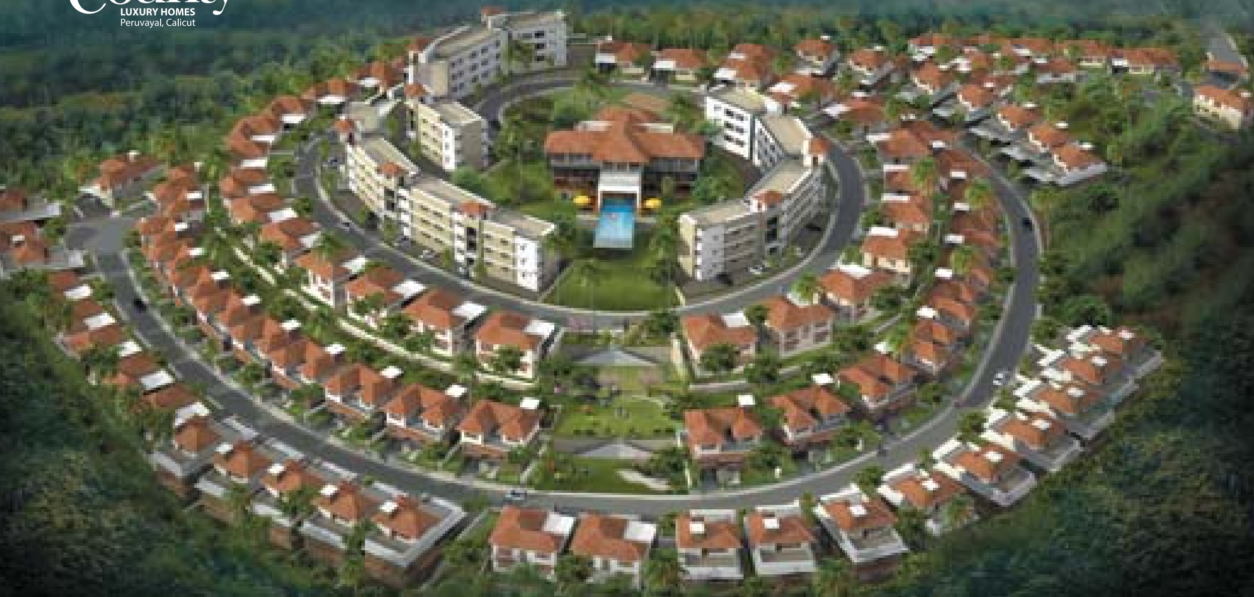
Bamboo Park at Green County